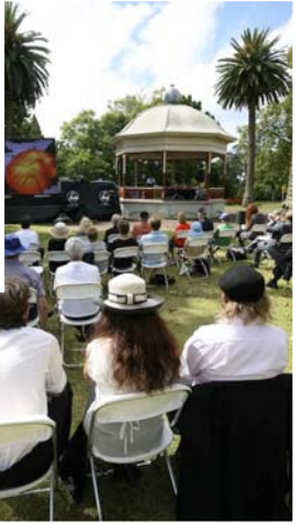
Memorial service at the Ruckland Domain after the funeral