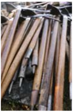
The Alpine Club's Guard of Honour at Sir Ed's Funeral