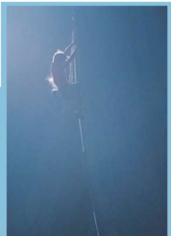
Rim Lit Climber, Céüse, France Grand Prize, 2008 Banff Mountain Photography Competition

www.banffcentre.ca/mountainculture/photo/competition/2008/