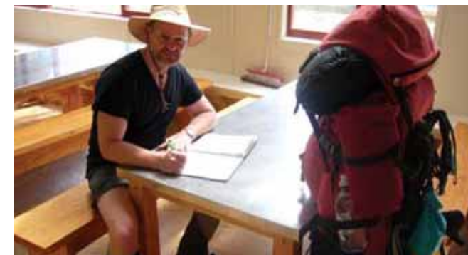
Filling out a hut log book, Totara Flats (Serviced), Tararua FP.