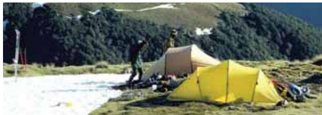
Self sufficient backcountry camping. Foley's Spur, Lewis Pass.

You can camp anywhere in the backcountry except where regulations prevent it such as close to some Great Walks. If you are camping beside a hut you can use hut facilities otherwise be completely self sufficient.