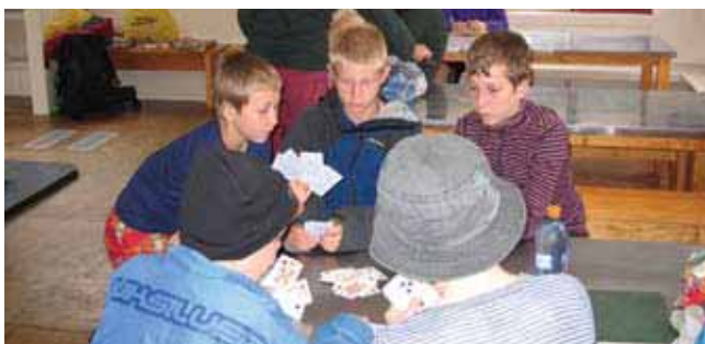
Enjoy the social environment of huts and make new friends. Take a deck of cards or a good book to enjoy. Photo: Totara Flats Hut (Serviced). R. Duindam