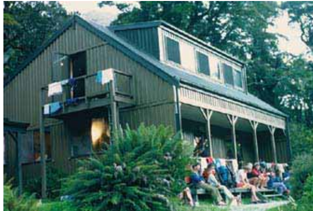
Great Walk Hut: MacKenzie Hut, Routeburn Track.