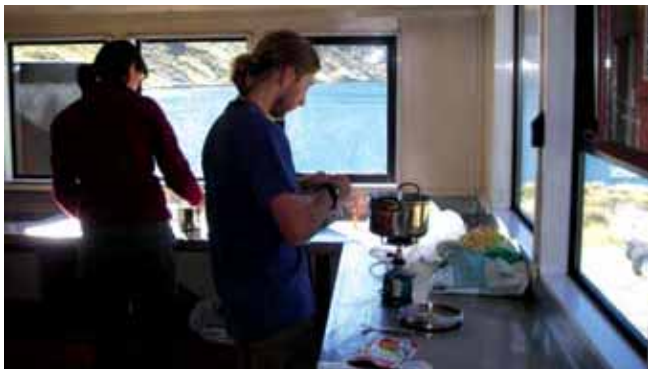
Lake Angelus Hut (Serviced), Nelson Lakes NP. Find out if cooking facilities are provided before you leave. You may need to bring your own.