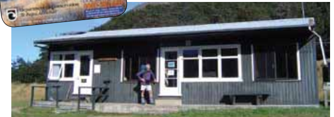
Mid Caples Hut (Serviced).

Adult $90. Youth: $45. Members of approved recreation associate groups: $63.