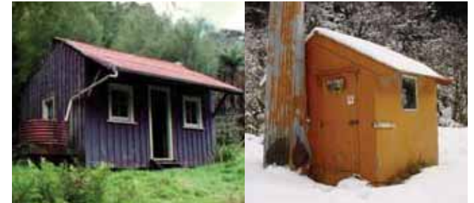
Downes Hut (Serviced).