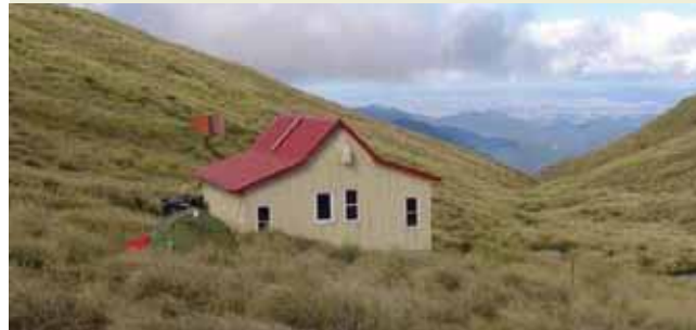
Kime Hut (Standard), Tararua Forest Park.