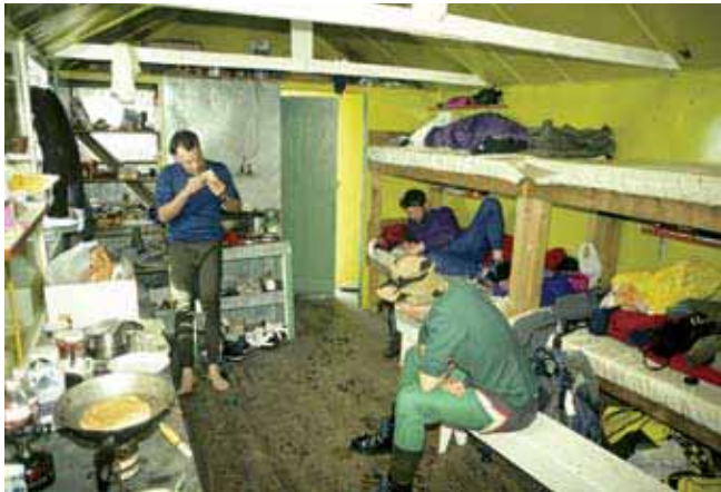
Breakfast at Top Waitaha Hut (Basic Hut), Waitaha Valley, West Coast.

Huts are more basic than backpacker hostels. They do not have showers, hot water, cooking and eating utensils or bed linen and you cannot buy food or equipment. Make sure you have everything you need before you set out. The Mountain Safety Council brochure Going Bush? has a gear list.