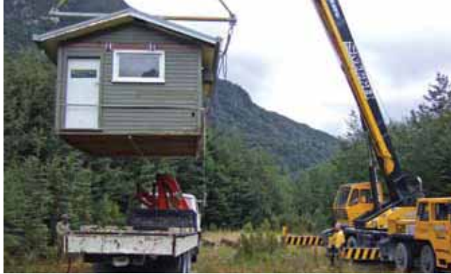
Relocation of West Arm Hut (Basic), Fiordland NP.

Some facilities and services operate on a seasonal basis. Huts can be moved or closed and extreme weather can damage tracks. Always check the Notices at the nearest DOC visitor centre or the website.