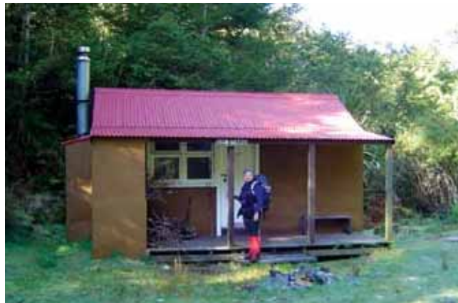
Standard Hut: Iron Gates Hut, Ruahine Forest Park.