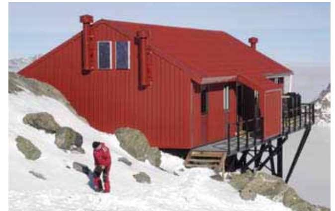
Serviced Alpine Hut: Plateau Hut, Aoraki/Mt Cook National Park.

There are a variety of other huts in backcountry conservation areas including biodiversity management huts, private bush cabins and recreation club huts. Some club huts such as the New Zealand Alpine Club (NZAC) huts are open to the public and listed on the DOC website: www.doc.govt.nz .