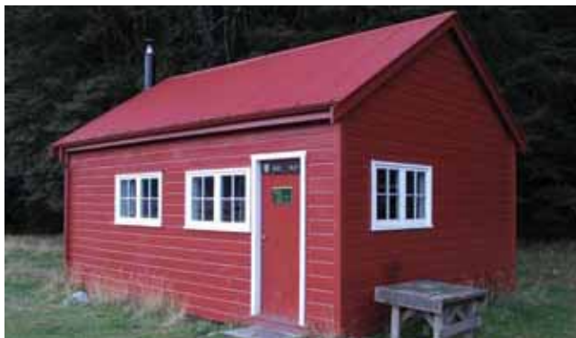
Red Hut (Standard/Historic). Built in 1916 for commercial guiding. Fully restored and open to the public.

Huts come in all vintages, shapes and sizes. Some date from the late 1800s, many were built in the 1930's to 1950's and the majority were built during the 1960's and 1970's for deer culling. Since the late 1970's new huts have been purpose built for recreation and DOC runs an extensive maintenance programme to keep them in good order.