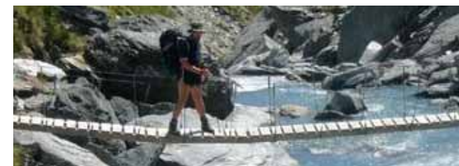
Rees Dart Track.