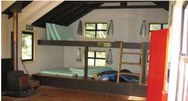
Mangahao Flats Hut (Standard), Tararua Forest Park. Huts provide simple shelter often with platform style bunks and lighting by candle.