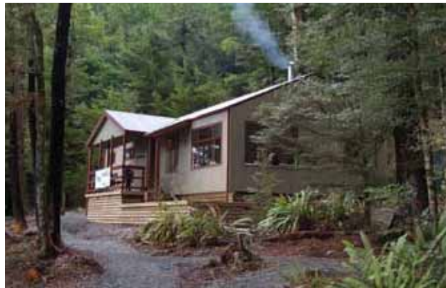
Serviced Hut: Sabine Hut, Nelson Lakes National Park.