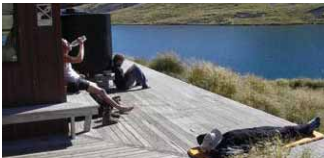
After a hard days tramp a backcountry hut provides a place to rest and recover. Photo: Angelus Hut. DOC