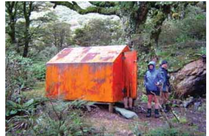
Basic Hut: Mid King Bivouac, Taraua Forest Park.