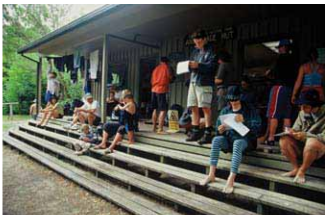
During peak season some huts can be very busy, so be prepared to share your adventure with others. Photo: Anchorage Hut (Great Walk).

Note: Dates may vary locally depending on conditions