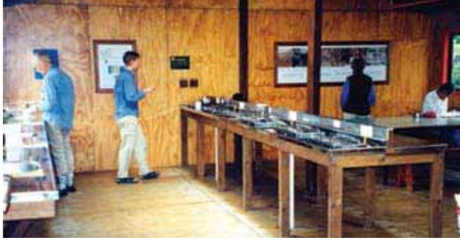
Clinton Hut (Great Walk), Milford Track. Cooking facilities provided in peak season. Remember to take your own food and equipment.

For details about the exact facilities at a hut (sleeping capacity, cooking facilities, heating, lighting, fees and booking requirements) check the backcountry hut information on the DOC website or contact a DOC visitor centre.