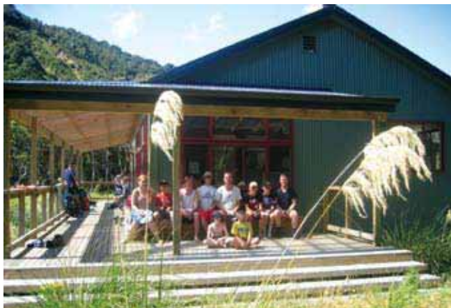
Tramping is a great way to enjoy the outdoors with friends and family. Photo: Totara Flats Hut (Serviced), Tararua Forest Park. R. Duindam