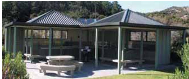
Great Walk campsites are usually well equipped, Anchorage Campsite, Abel Tasman Coast Track.