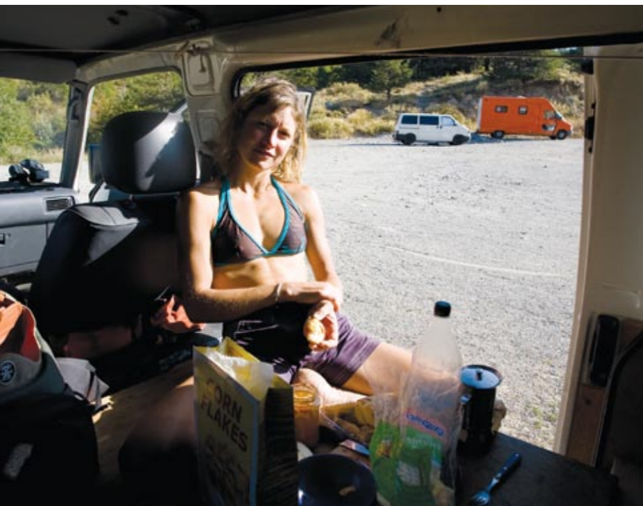
ABOVE Van life, break-fast in the parking lot.