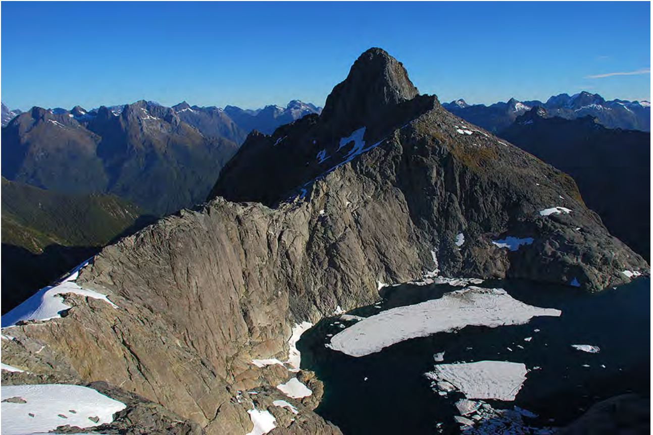
Terror Peak and Lake Terror from the Llawrenny Peaks.