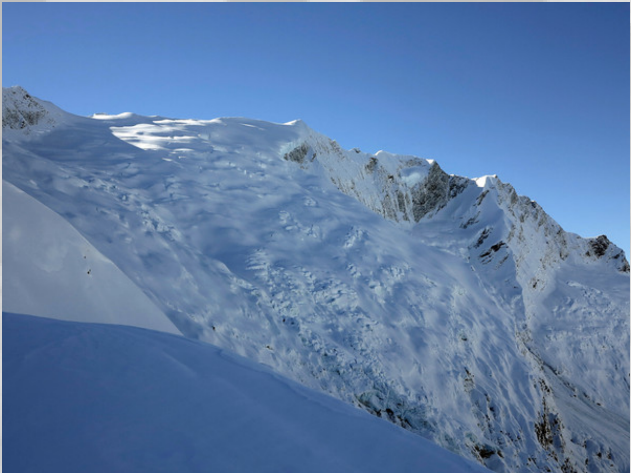
Rob Roy South West Face.

If your group of five or more is interested in renting, please contact Lindsay at 027 404 8911.