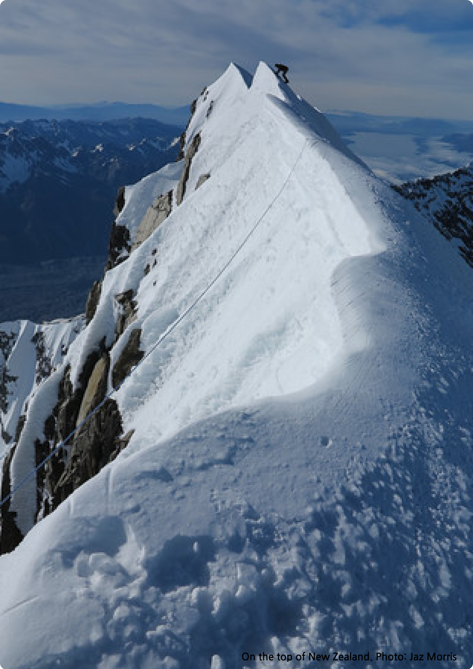
On the top of New Zealand.