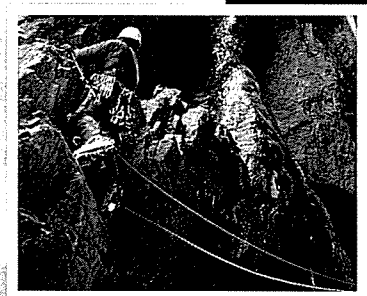
Canadian Ice Pat Deavoll explores a Northern Hemisphere destination