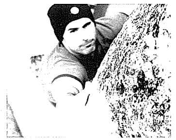
Biddy on the Little Big Wall, Wanaka.

Bouldering It's got to be good for you! By Ivan Vostinar