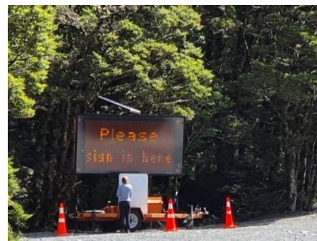
Image showing the intentions whiteboard at the Homer Saddle Carpark attached to the Variable Message Sign trailer. Please leave your climbing and hiking intentions on this board if you are heading up to the Homer Saddle, Mātuitui or surrounding areas.