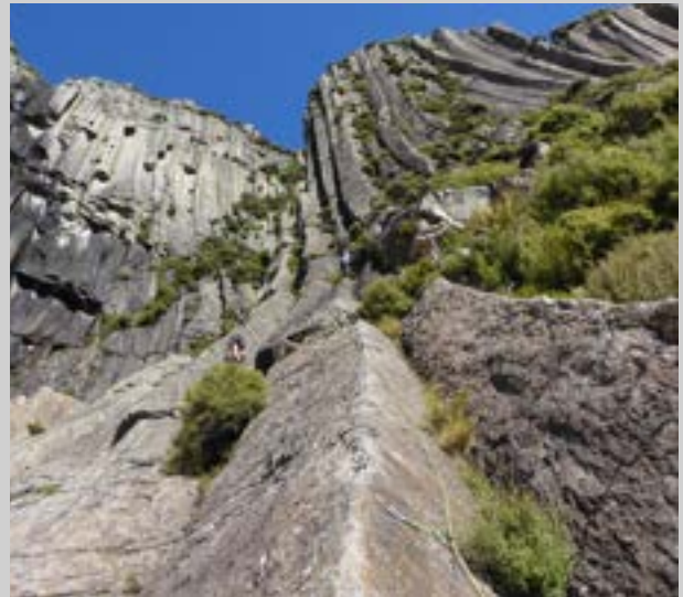
LOOKING UP FROM THE BASE OF THE FORTRESS, MOLLY (LEFT) AND EVE (RIGHT) LEADING

We started with a hike up to the Meatgrinder wall, carefully watched by a circling pair of Kārearea/NZ falcons. This is one of the furthest and highest crags to reach (about 1 ½ hours) but makes a good starting point with a lot of well protected moderate grade trad climbs to warm up on, as well as stunning views back down across the Pinnacles to the hut and east across the Canterbury plains. After a morning at the Meatgrinder we then descended a short way to the nearby Christian Principles crag, disturbing a few basking skinks in the process. This crag has some longer routes, including The Staircase (16), a 30m climb following twin cracks with great gear and exciting airy moves up over a roof near the top and Bring Back The Cain (15), a beautiful crack climb with some committing moves for the grade