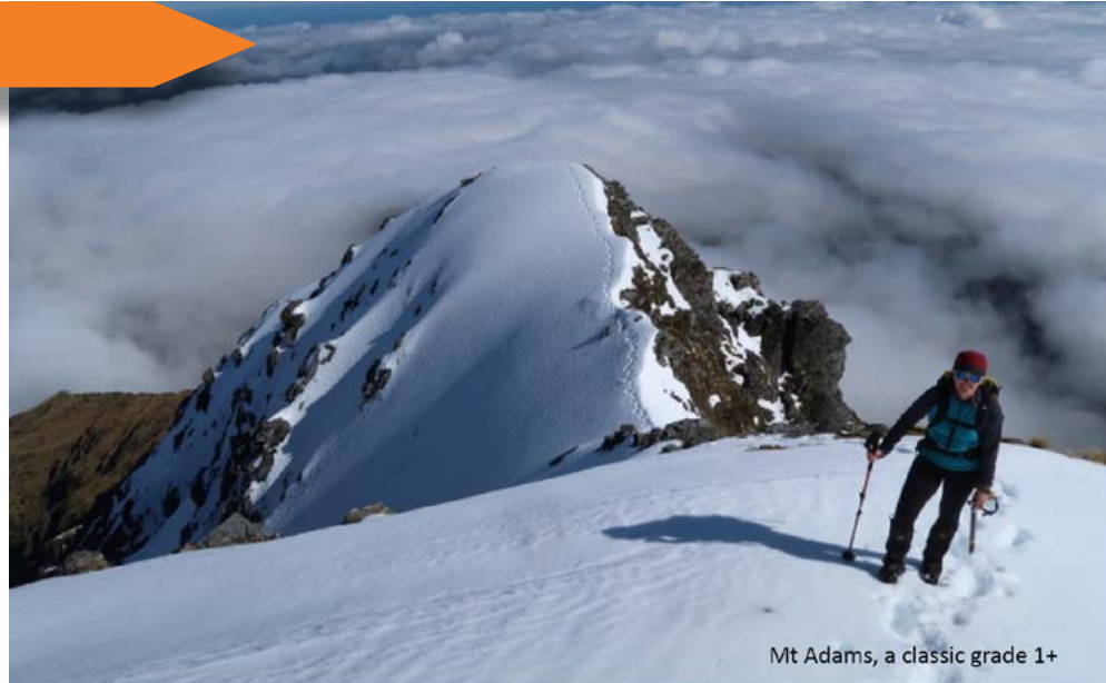
Mt Adams, a classic grade 1+

Entry is free and everyone is welcome, you don't need to be an NZAC member to attend.