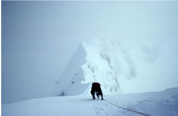
Climbing the East Ridge of Mt Una, Spenser Mountains.

NZAC life member, climber, environmentalist and landscape photographer, Craig Potton, will present Finding the Wild : exploring the value of alpine wilderness and the environmental crisis. Come and hear what's really going on, supported by some beautiful and inspiring images.