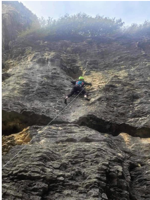
Pohara rock action