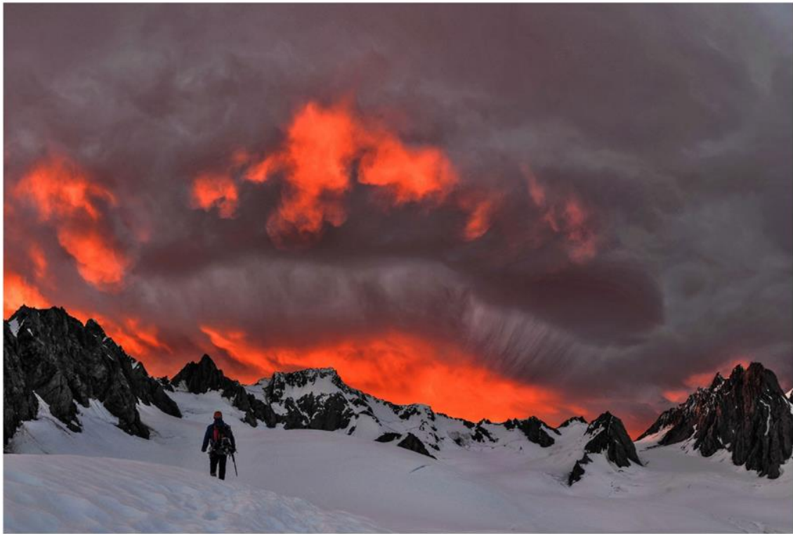
Dawn view from above Pioneer Hut (2,380m) to the main divide, Westland Tai Poutini National Park. From left Mt Alack, Douglas Peak, Mt Holdinger, Grey Peak and Mt Hoast