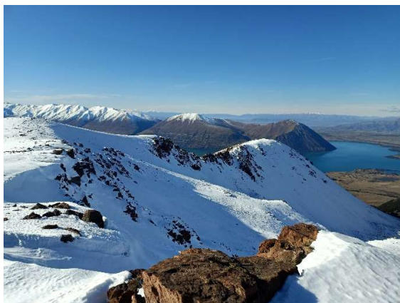
Looking down the ridge I came up