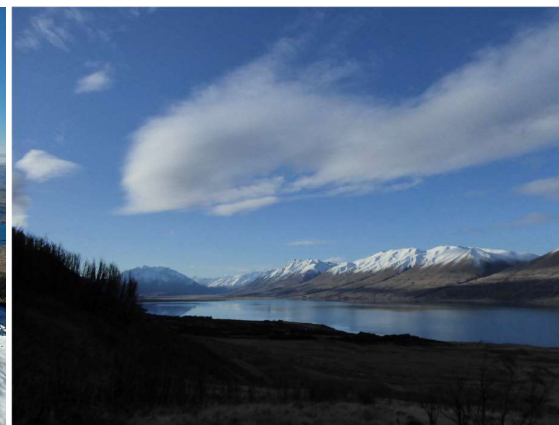
Views over Lake Ohau