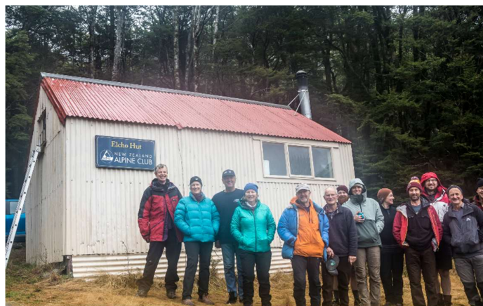
The team outside of the re-nailed hut

The hut is in good condition and is well used by climbers, trampers, hunters and 4-wheel drivers. A summer work party will be required to repaint the hut, relocate the toilet, replace the fire bricks in the log burner, and replace the axe (stolen again!).