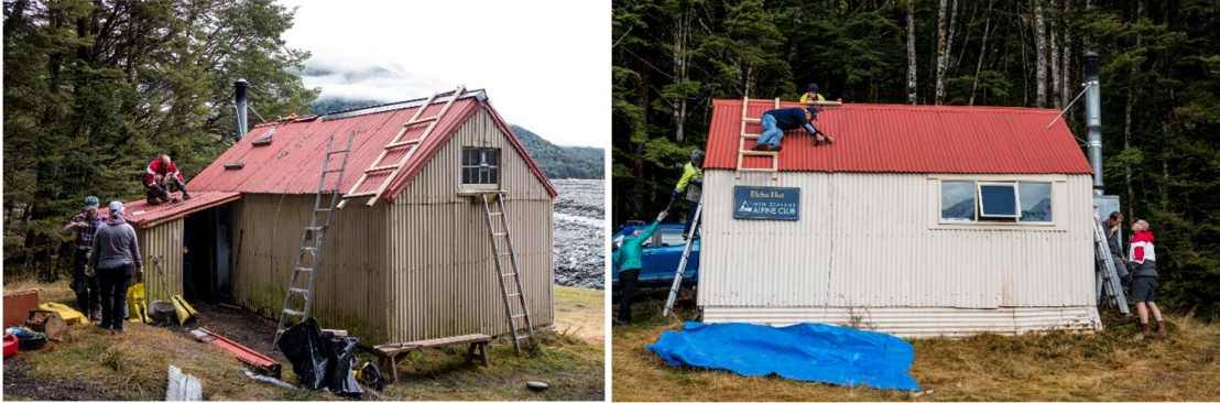
The team using their climbing skills to remove and replace the nails