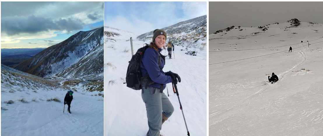
It took a while to go up the snow but a quick descent

Reminded us what a great local resource we have there and hoping to go back for a winter weekend later in the season.