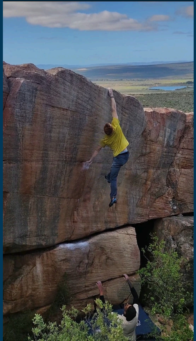
Leap of Faith V11

“So psyched to climb this perfect line in just a session. 4th day on wasn't ideal but somehow made it work with the worst skin I've had. Well needed rest day today and then back into it tomorrow.”