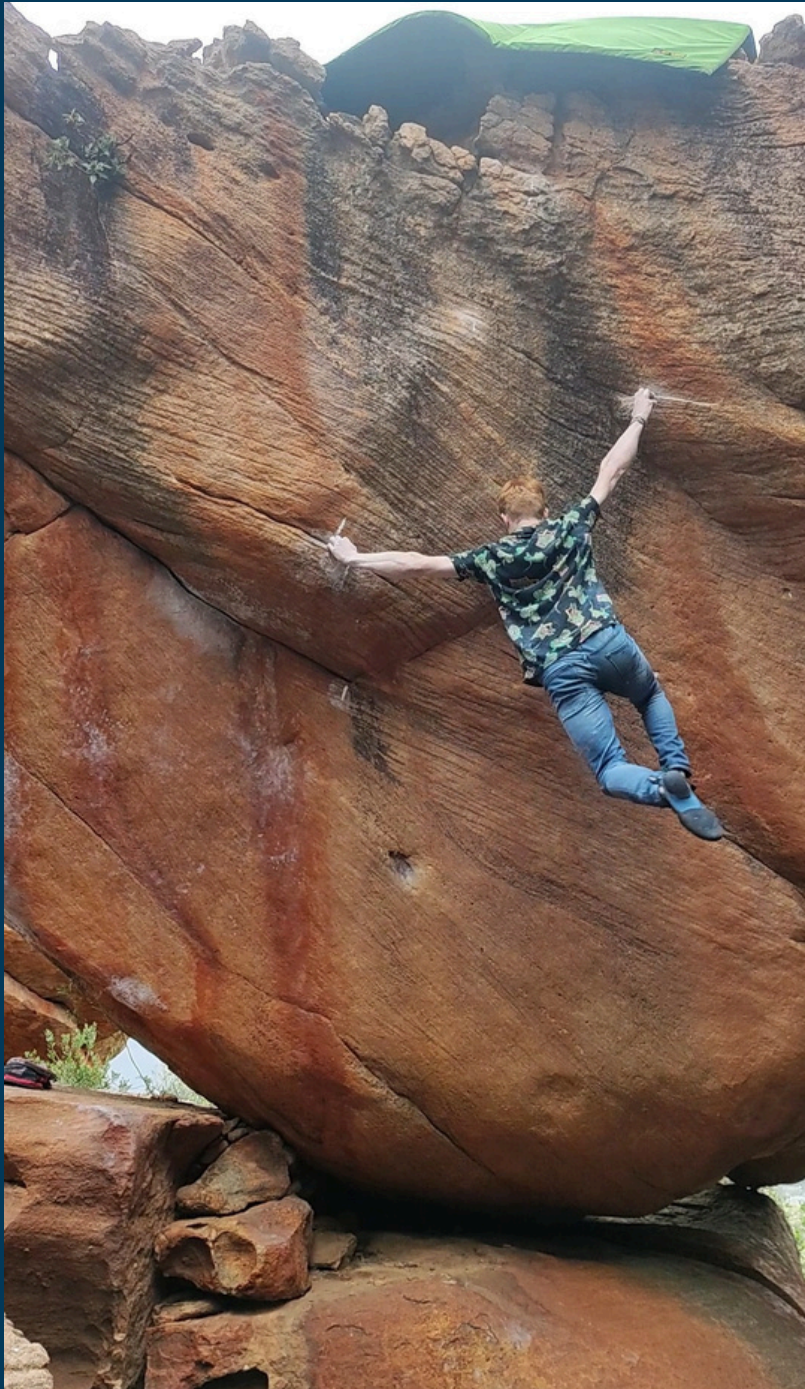
El Corazon V13

“So psyched to climb this perfect line in just a session. 4th day on wasn't ideal but somehow made it work with the worst skin I've had. Well needed rest day today and then back into it tomorrow.”