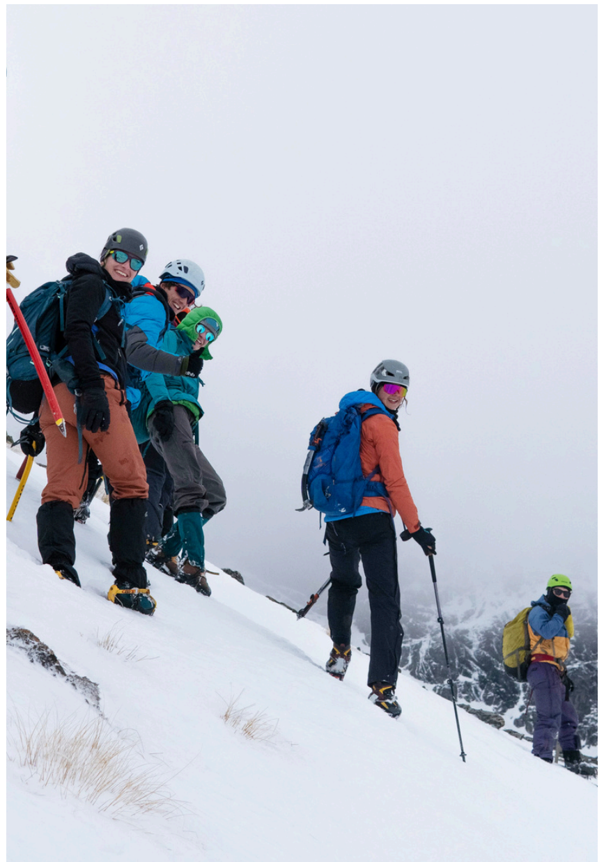
Members of the Snowcraft 1 clinic at the Remarkables Ice and Mixed Festival practicing avalanche rescue. Rs

We have also replaced the straps on the older grey snowshoes. We now provided bungy cords to keep the sets together.