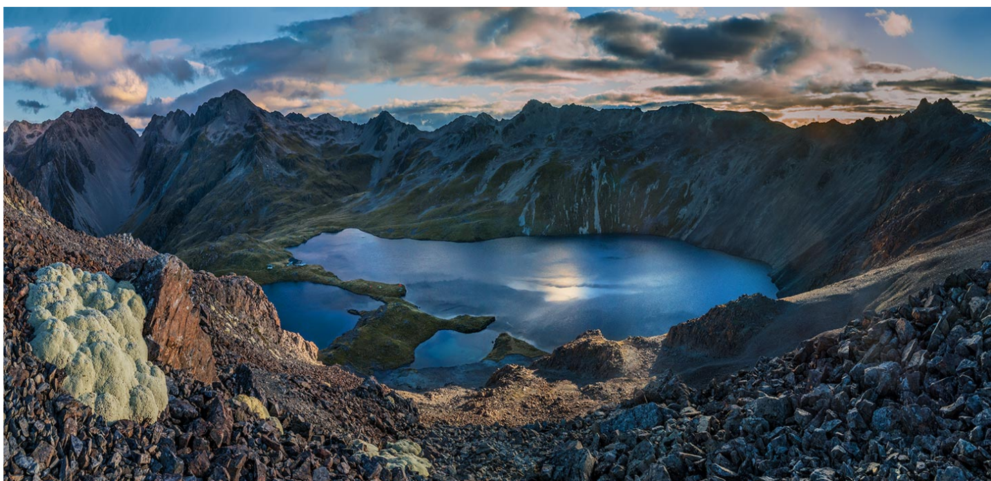
Sunset view from the northern side of Lake Angelus