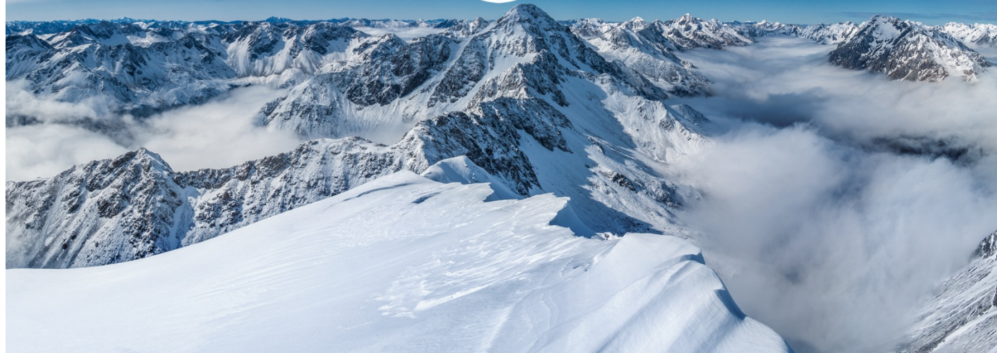
Mount Cupola summit view to Mount Travers

> Chair's update > Events > Courses > Trips > From the Editor > Committee contacts > Our club on a page