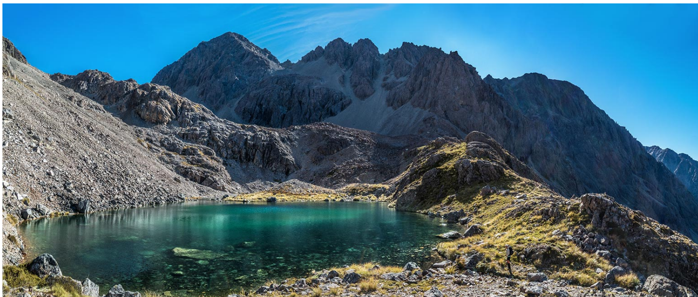
The southern-most of the two large tarns at 1600m, above the steepest section of the Sunset Saddle route