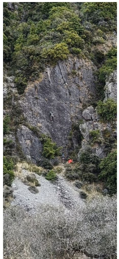
Graham on Balls - Twin Cracks area