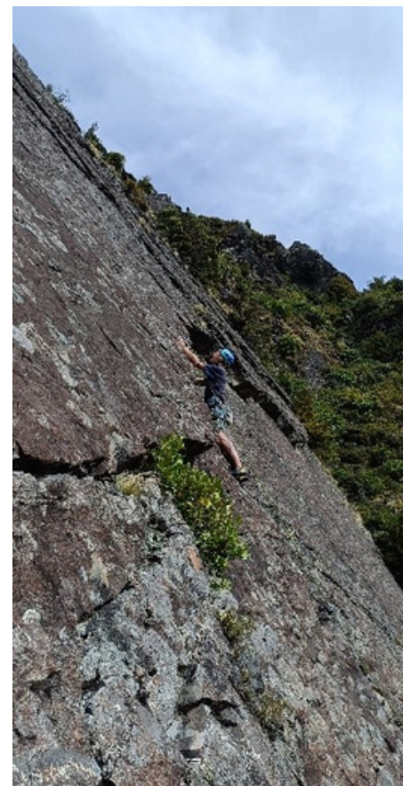
Graham on Freshly Squeezed - Orange Wall